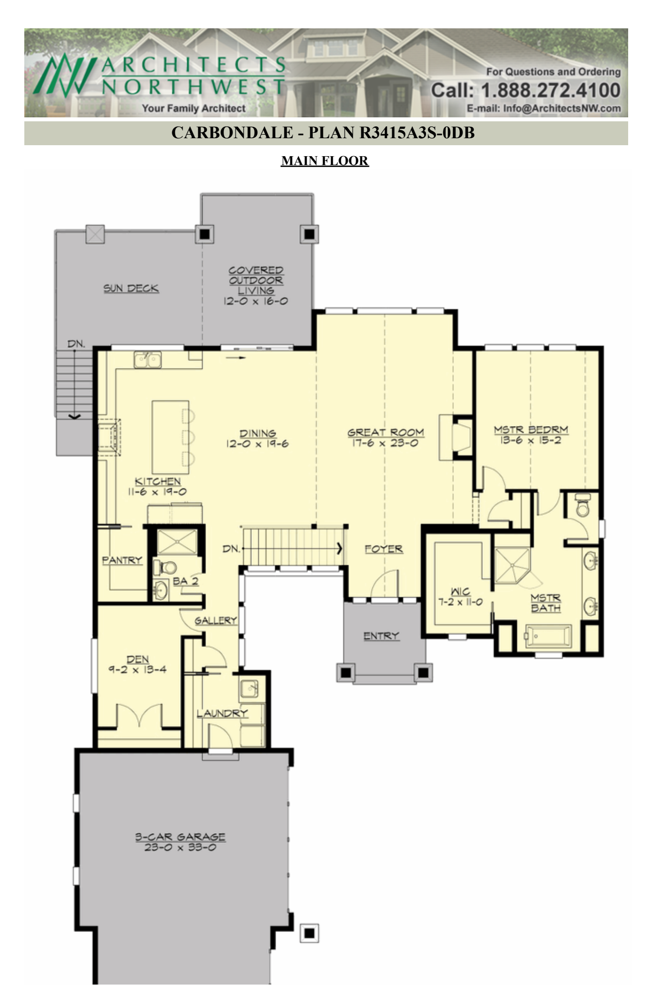
COPYRIGHT NOTICE: It is illegal to build this plan without a legally obtained set of prints. It is illegal to copy or redraw these plans. Violation of U.S. Copyright Laws are punishable with fines up to $150,000.